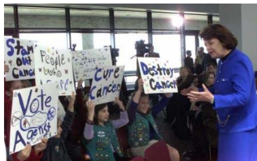
Senator Feinstein with members of WIN ABC volunteers from Girl Scout Troop 1115 from Severna Park, Maryland

⊗ Provide patients with a "Cancer Quarterback."