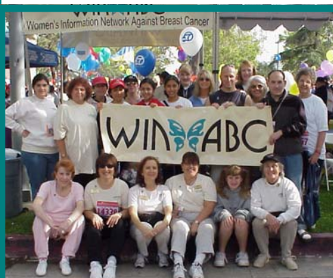
WIN ABC staff, volunteers and more team members.

WIN ABC is a proud beneficiary of the REVLON Run/Walk and receives funding for its programs and services through the money raised from the day's event. Each beneficiary is funded proportionately to the size of its team and the amount of money raised as a team. Your ongoing participation and support is much appreciated and