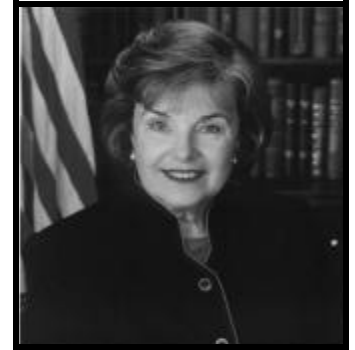
Senator Dianne Feinstein received the Winning Spirit Award for Leadership.